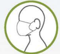
NO-SEW MASK USING A FOLDED SCARF/BANDANA AND RUBBER BANDS/HAIR TIES

For more information on non-medical masks or face coverings consult: https://www.canada.ca/en/public-health/services/diseases/2019-novel-coronavirus-infection/prevention-risks/about-non-medical-masks-face-coverings.html