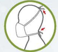
NO-SEW MASK USING A T-SHIRT